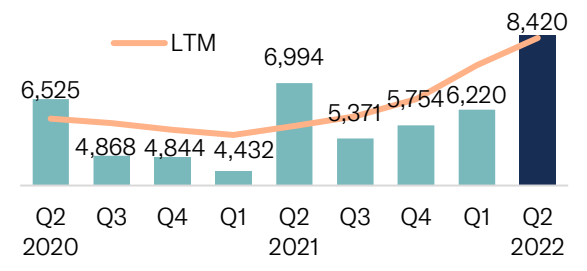
Sales bridge, Q2