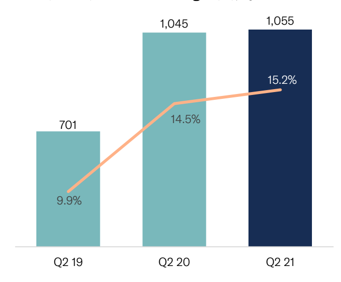
EBITA (SEKm) and EBITA margin (%), LTM1)