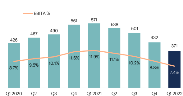
Adjusted EBITA, LTM, SEKm